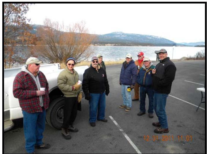
TAKING ON COFFEE