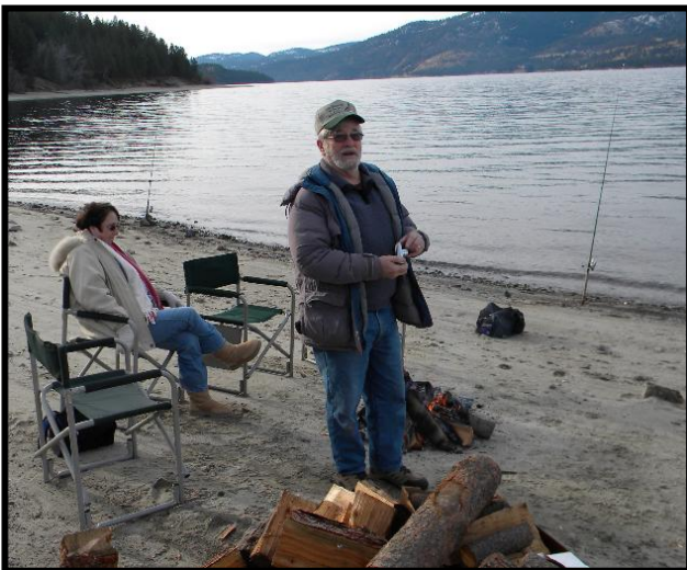
SERIOUS FISHERMEN (nice fire)

NEW YEARS FISH OUT: 15 or so club members attended the New Year's fish out at Bradbury Beach. Everybody had a good time, they enjoyed hamburgers and hot dogs, hot Chile, potato chips, hot coffee and hot chocolate. Didn't hear if anybody had to clean any fish.